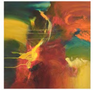
San Bartolo's Earring , diptych, 2008 oil on canvas, 24" x 48"