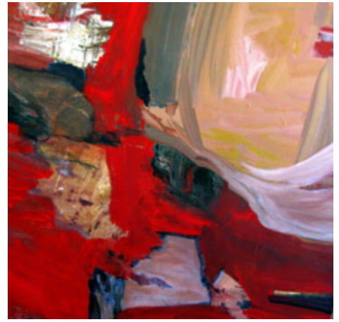
Enter Portal, 36x36", acrylic on canvas