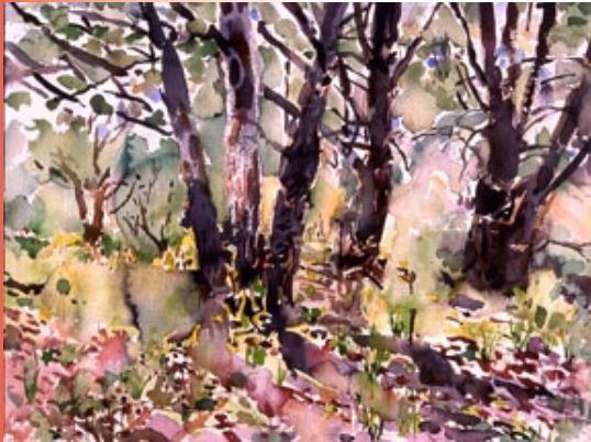
Above: Hackberries watercolor on paper