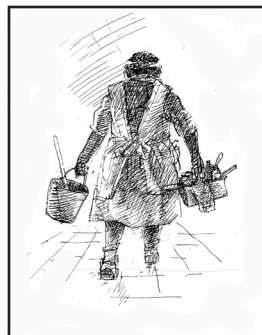
Work, Ink Drawing