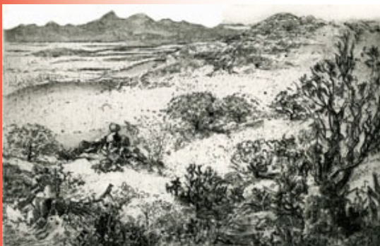
Below: Oracle , etching