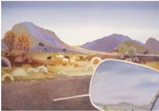
Ellen Fountain, Taking a Look Back, watercolor, 15" x 22", 1985, private collection.

Spring 2008 Newsletter & Schedule tds@thedrawingstudio.org www.thedrawingstudio.org