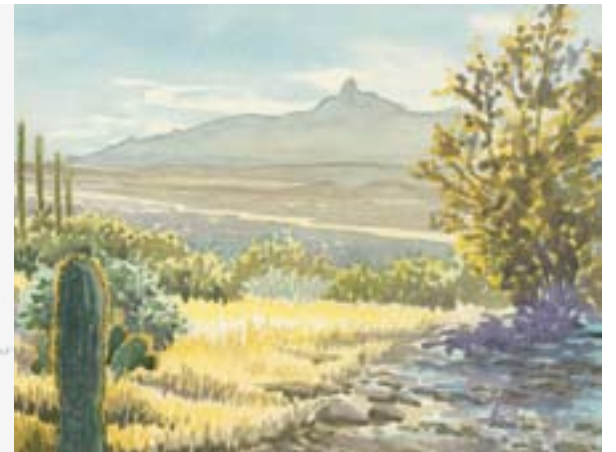
Avra Valley from Red Hills, photo study, pencil study and finished watercolor, 9" x 12", 2007.