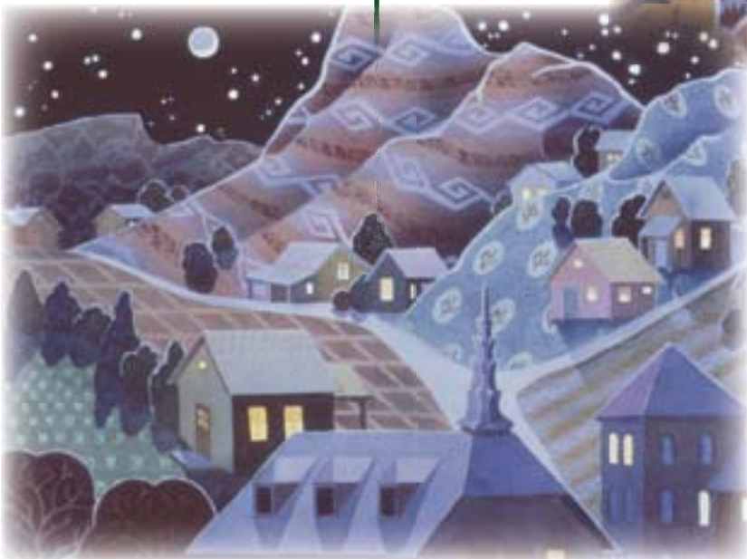
Bisbee Nights, watercolor, 22" x 30", 1984, private collection.