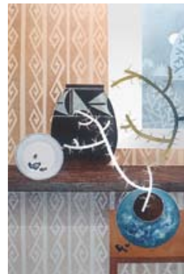
Southwest by Far East , watercolor, 22" x 15", 1983, private collection.

While I still take a camera with me when I go out to paint, I only take photos at the end. Many of these are telephoto shots that let me zoom in on some feature of interest. But my drawings are my primary resource, because as I draw I'm already editing, rearranging, deleting, exaggerating, simplifying, and so on. That's something the camera cannot do. In some ways, it seems like I've come full circle. My plein-air work is again more representational—as were my first landscapes 30 years ago—but these paintings feel far more authentic and satisfying. The years of practice and willingness to challenge myself anew has shown that change is good!