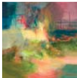
Canto Gitano , acrylic on canvas, 48" x 48", 2007

Conrad Wilde Gallery April 4–26. Reception April 12, 6–9 pm