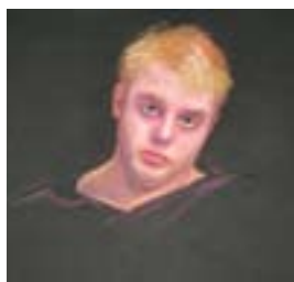
Attitude , pastel, 24" x 18", 2008

Visual Arts Center Punta Gorda, Florida February 1 to March 14, 2008