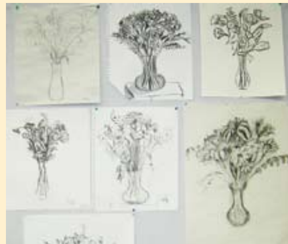
Student drawings from Katie Cooper's Fundamentals I class