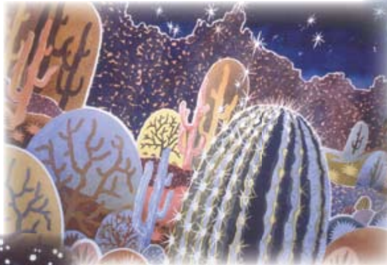
Clouds Over the Superstitions, watercolor, 15" x 11", 1980, private collection.

Spring 2008 Newsletter and Schedule Vol. XIV, No. 2 April 1 – May 31, 2008